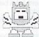
ASHRA MAN Ashra Buster